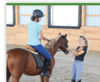
Balanced Riding Course Learn More